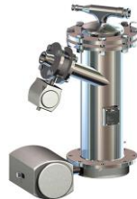
VACUUM POWDER TRANSFER SYSTEM