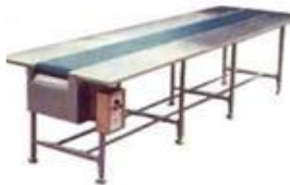
PACKING CONVEYOR TABLE