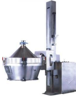
FBD BOWL LIFTING TILTING DEVICE