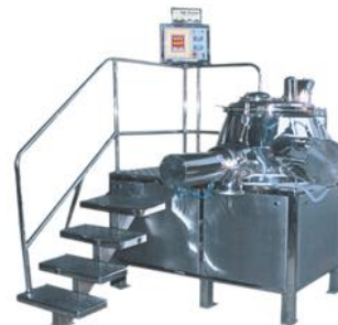
RAPID MIXER GRANULATOR