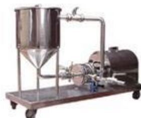
HIGH SPEED INLINE HOMOGENISER