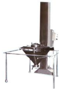
IPC LIFTING DEVICE