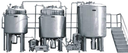
LIQUID SYRUP MANUFACTURING PLANT