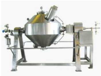
ROTOCONE VACUUM DRYER