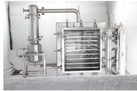
VACUUM TRAY DRYER WITH CONDENSOR