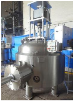
AGITATED NUTCH FILTER & DRYER

EMAIL : kalpesh@Jaypharmamachinery.com www.JayPharmaEquipments.com