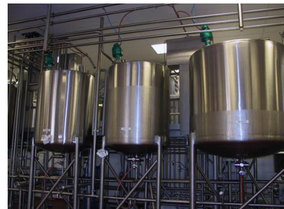
STORAGE TANK WITH MIXING STIRRER