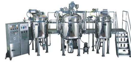
OINTMENT MANUFACTURING PLANT