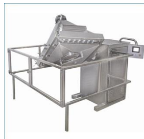
CONTA BIN BLENDER IPC BIN BLENDER