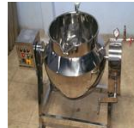
STARCH PASTE KETTLE