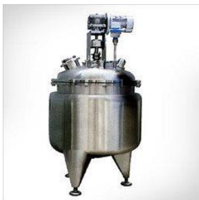
SHAMPOO / TOOTH PASTE MANUFACTURING TANK