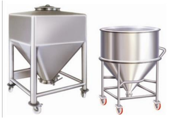
PRODUCT CONTAINER IPC BIN (SQUARE / ROUND)