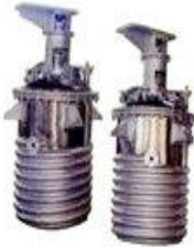
SS REACTOR DISTILLATION TANK

THE LUBRICATED GRANULES ARE UNLOADED DIRECTLY IN THE IPC. THE IPC WITH LUBRICATED GRANULES IS LOADED ON A SS STAND MOUNTED ON THE COMPRESSION MACHINE.