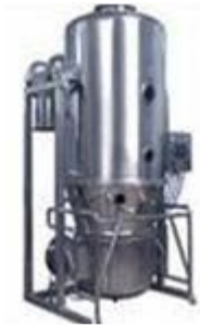
FLUID BED DRYER