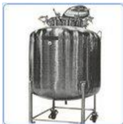
DISTILLED WATER STORAGE TANK