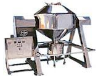
DOUBLE CONE BLENDER